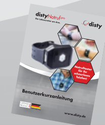
User brief instruction