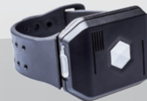
distyNotruf pro with bracelet